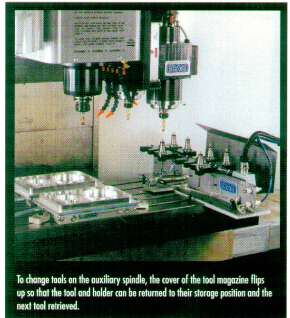
To change tools on the auxiliary spindle, the cover of the tool magazine flips up so that the tool and holder can be returned to their storage position and the next tool retrieved.

each spindle can be stored in the toolchanger. The magazine also has a cover to protect the toolholders from chips and coolant. Programming only two lines of code in the standard part